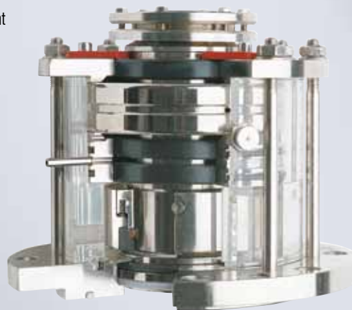
The EagleBurgmann M481KL-D20 for top driven steel tanks acc. to DIN can be equipped with an polymerization barrier.

It has performed very effectively in practice in this way. In most cases, the design takes the form of a concentric labyrinth.