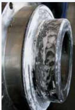
It shouldn't look like that: Mechanical seal with deposits.

medium instead of the flushing medium. In this case, however, a corresponding connection must be provided. In most applications the flush is operated continuously. In this case, it is impossible to prevent a certain amount of the flushing medium getting into the product. If this cannot be tolerated, it may be sensible to adopt flushing with nitrogen. The flow rate can be set here using a gas supply system such as an EagleBurgmann GSS.