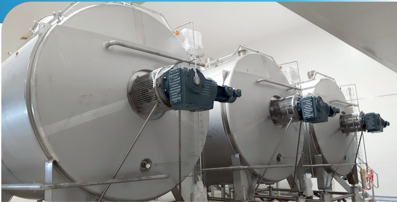
Container with agitator

Very few seals can effectively handle a large axial displacement and significant shaft deflection. One of these is SeccoLip with its proven and patented lip design that can reliably compensate for shaft deflection.