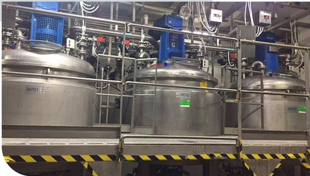
The three mixers at Canan Kozmetik